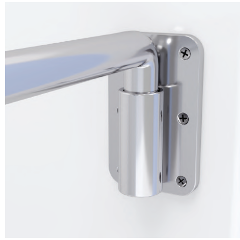
Step 6: Install rod.

Tighten each screw in an alternating sequence pattern until bracket is firmly pressed to the wall without movement. This will limit risk of cracking wall surface.