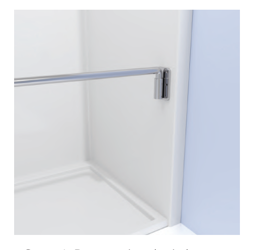
Step 1: Determine height Measure and determine desired height and location mounting location wall support. NOTE: the curtain must touch floor when installed in barrier free showers.