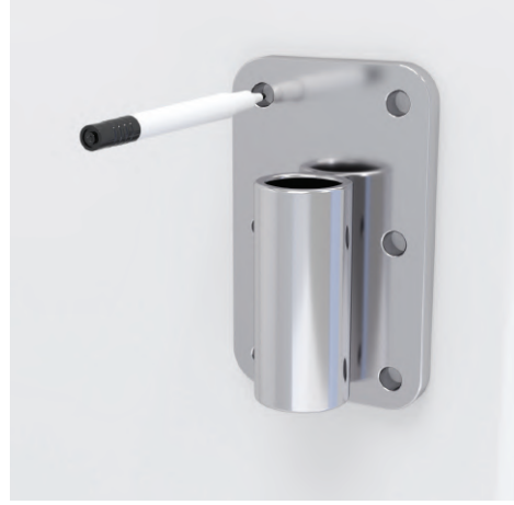
Step 2: Mark drill locations