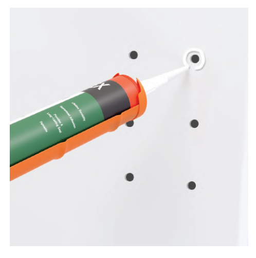
Step 4: Apply Caulk.

Always apply caulk in a circular pattern around each hole drilled to prevent water migration into the wall cavity. Use a premium clear silicone adhesive caulk.