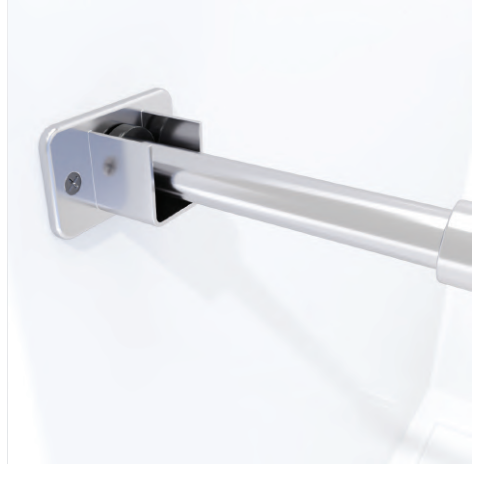
Step 8: Install Receiver bracket.

To extend the telescopic rod across the full width of the shower opening, grip and twist cap by hand and pull to extend rod across shower opening. The extension section of rod will be tight for shipping reasons, use of pliers may be required.