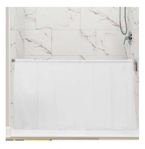
Step 9: Install curtain.

Place receiver bracket in position beneath the location where the rod touches the wall. Repeat steps 1-5.