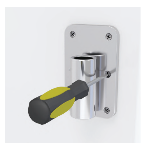
Step 5: Tighten Screws equally.

Always apply caulk in a circular pattern around each hole drilled to prevent water migration into the wall cavity. Use a premium clear silicone adhesive caulk.