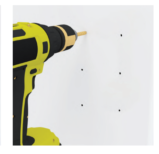
Step 3: Drill holes.

Determine correct size drill bit for the fastener to be used. Always use a drill bit with countersink head to avoid risk of screw cracking or chipping finish (Tile, marble, granite, acrylic or Fiberglass, other).